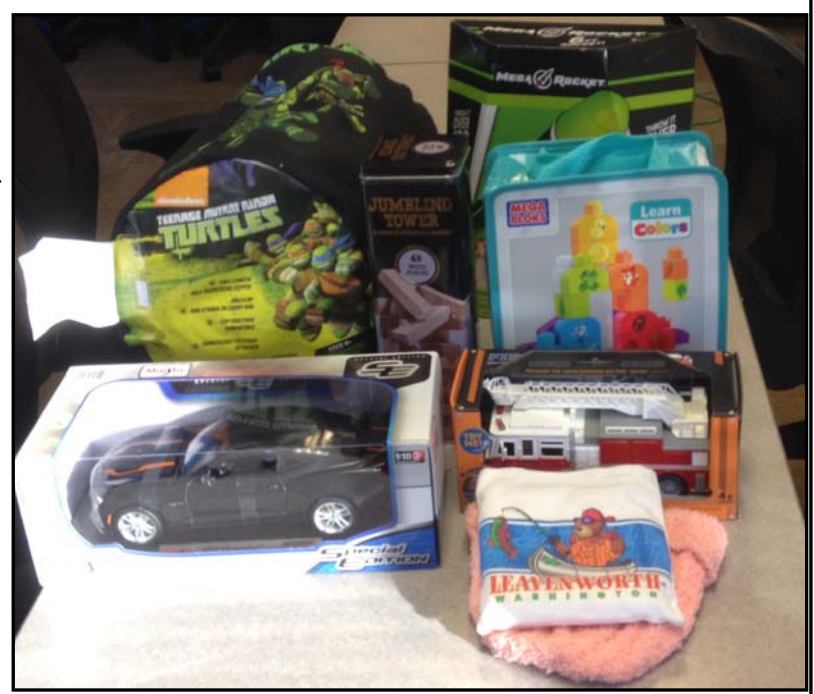
Toys collected at our 12/6 meeting for Toys For Tots

Sound Generations (formerly Senior Services) has connected older adults and adults with disabilities in King County with vital resources to help them thrive. They are a 501 (c) (3) nonprofit organization providing seniors with Meals on Wheels and free rides to medical appointments, fitness programs and opportunities for meaningful engagement with others. They alleviate stress by connecting seniors and those who care about them to whatever they need to remain safe, active and healthy and they are committed to helping all people especially those in low-income communities and communities of color to feel included and respected.