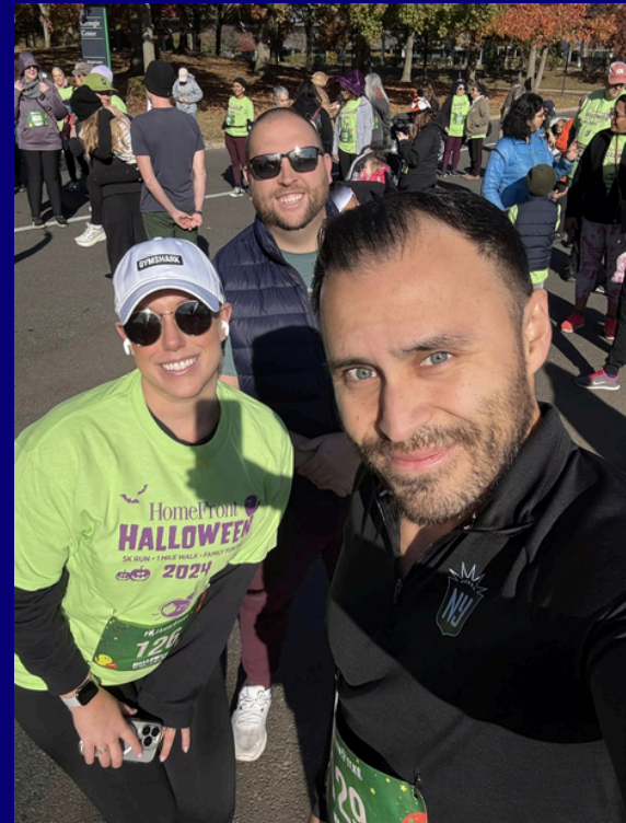
AGA Trenton Chapter members participated at the 2024 HomeFront's Halloween 5K Run and 1 Mile Walk on Sunday, October 27, 2024.

AGA offers leadership and speaking opportunities that have significantly enhanced my public speaking skills, allowing me to confidently engage with diverse audiences and effectively communicate complex ideas.