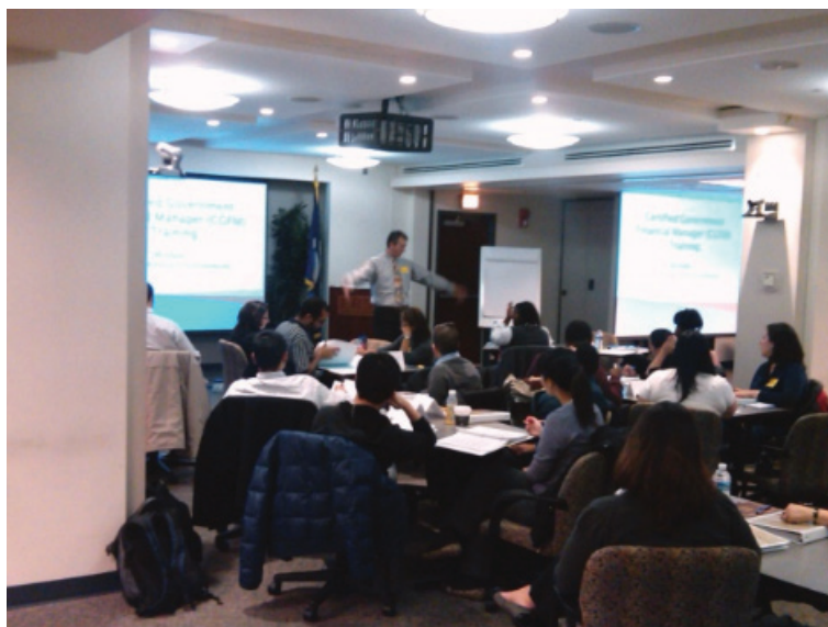
Winter CGFM Training

http://www.agacgfm.org/cgfm/downloads/CGFMCompensationSurvey.pdf