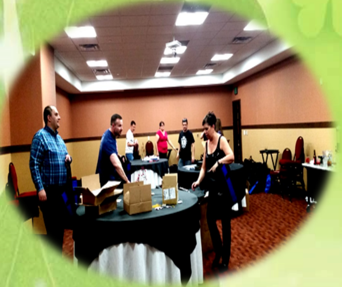
NM and ABQ CEC Members at work putting the attendee bags together