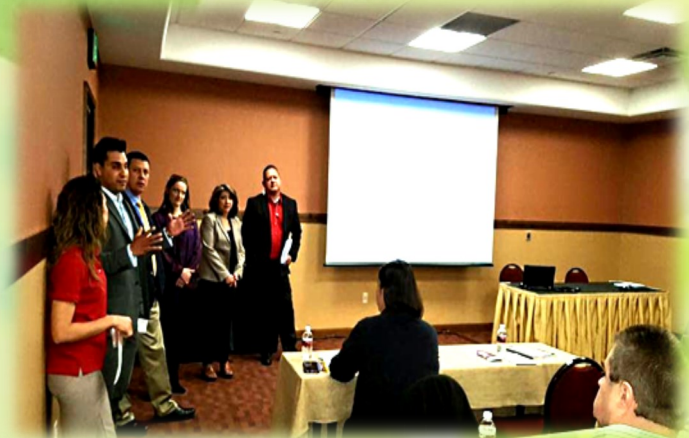
* Chapter CGFMs take part in training of future CGFMs at 2nd annual CGFM Day