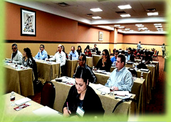
* Participants at CGFM Day learning the overview of 3 exams

I encourage all those interested in attaining the CGFM certification to go to the AGA National website at https://www.agacgfm.org/CGFM-Certification/About-CGFM.aspx in order to gain an understanding of the CGFM process, preparing for exams, scheduling your exams and required forms. Feel free to contact any of our board members if you have any questions.