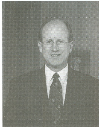
The Honorable David M. Walker, Comptroller General of the US

July 3-7, 2000: AGA Professional Development Conference & Exposition, San Francisco Marriott, San Francisco, CA (see page 9)