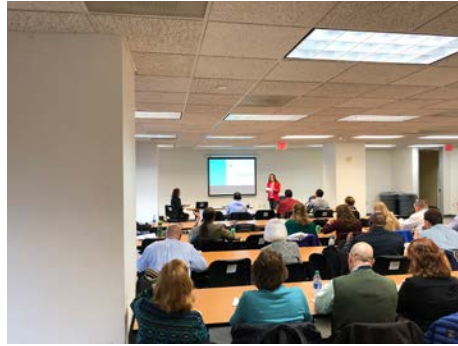
Attendees were engaged for taxes