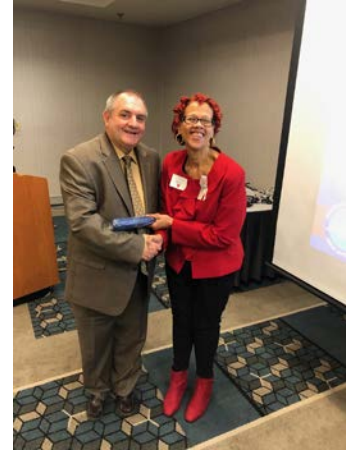
Department of Corrections came to speak to AGA