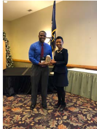
AGA National President-Elect spoke and attended