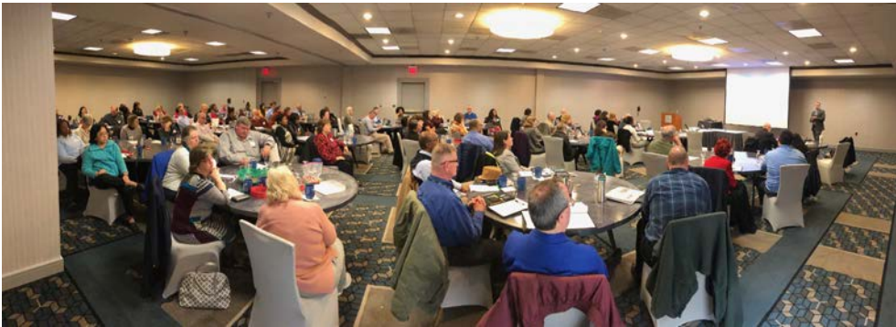
The room was packed learning about "Why is Why," "Implicit Biases," and "Being in a Connected World"