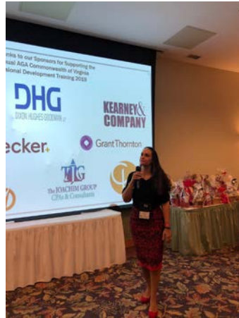
CEC Board Member singing National Anthem