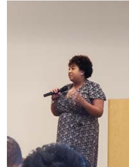
Charity representative and survivor spoke