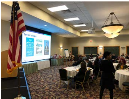
The session was filled to capacity with everyone getting educated