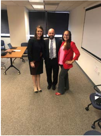
Great job to our tax presenters!