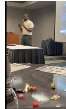
CCR was presented with a fitness twist