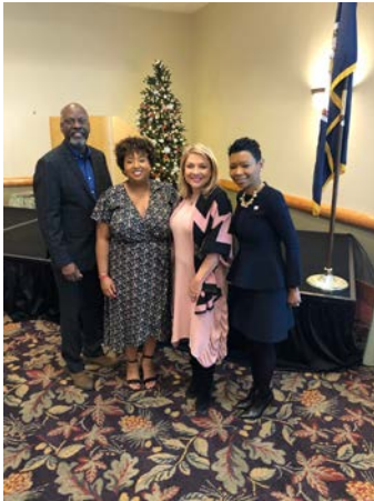
Immediate Past President with charity