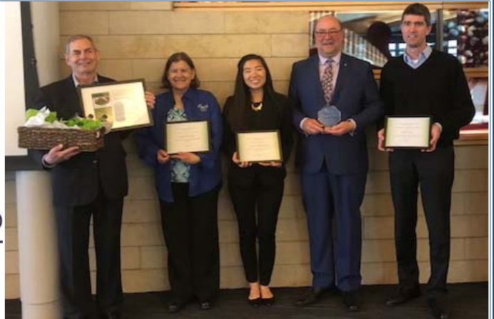
SEATTLE AGA 2018 AWARD RECIPIENTS