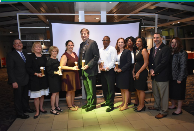
The MPGC Chapter celebrated its 50th Anniversary in September.