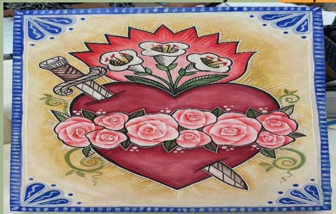
Picture of the Retablo donated by the NM Chapter

Future National PDTs? Always held in July of each year.