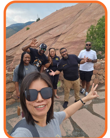
Can't visit Denver without a Red Rocks stop with the Premier Group Team!