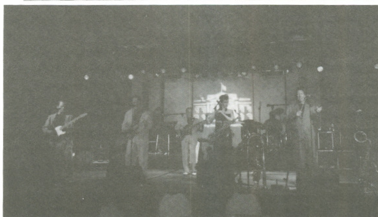
The Fabulous Hubcaps entertaining at the PDC in June.