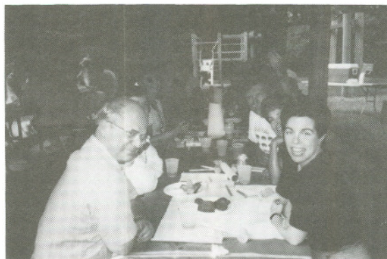
Chapter members enjoying the crab feast at Seneca Creek Park in July.