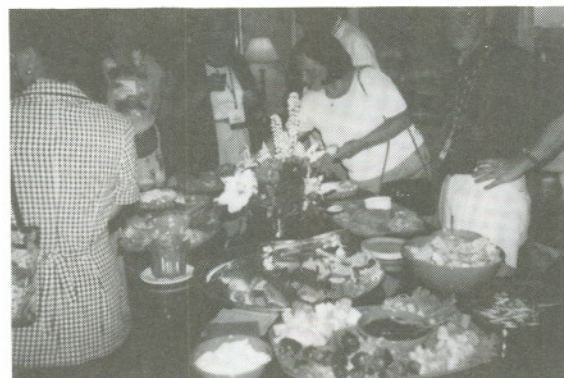
The PDC Host Committee Hospitality Room.