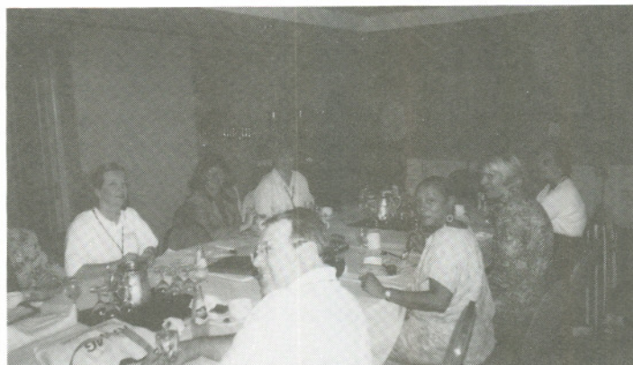
The PDC Host Committee hard at work.