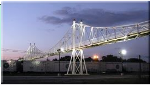
Jefferson Street Bridge