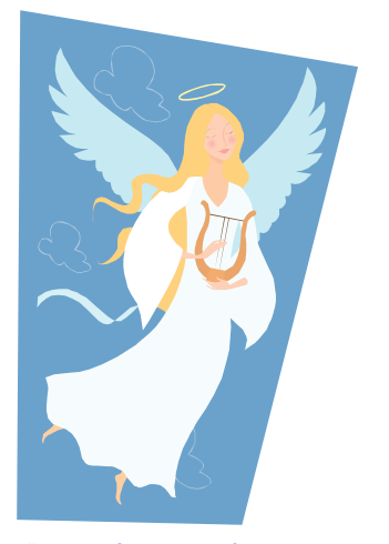
"Let the Angels Sing"