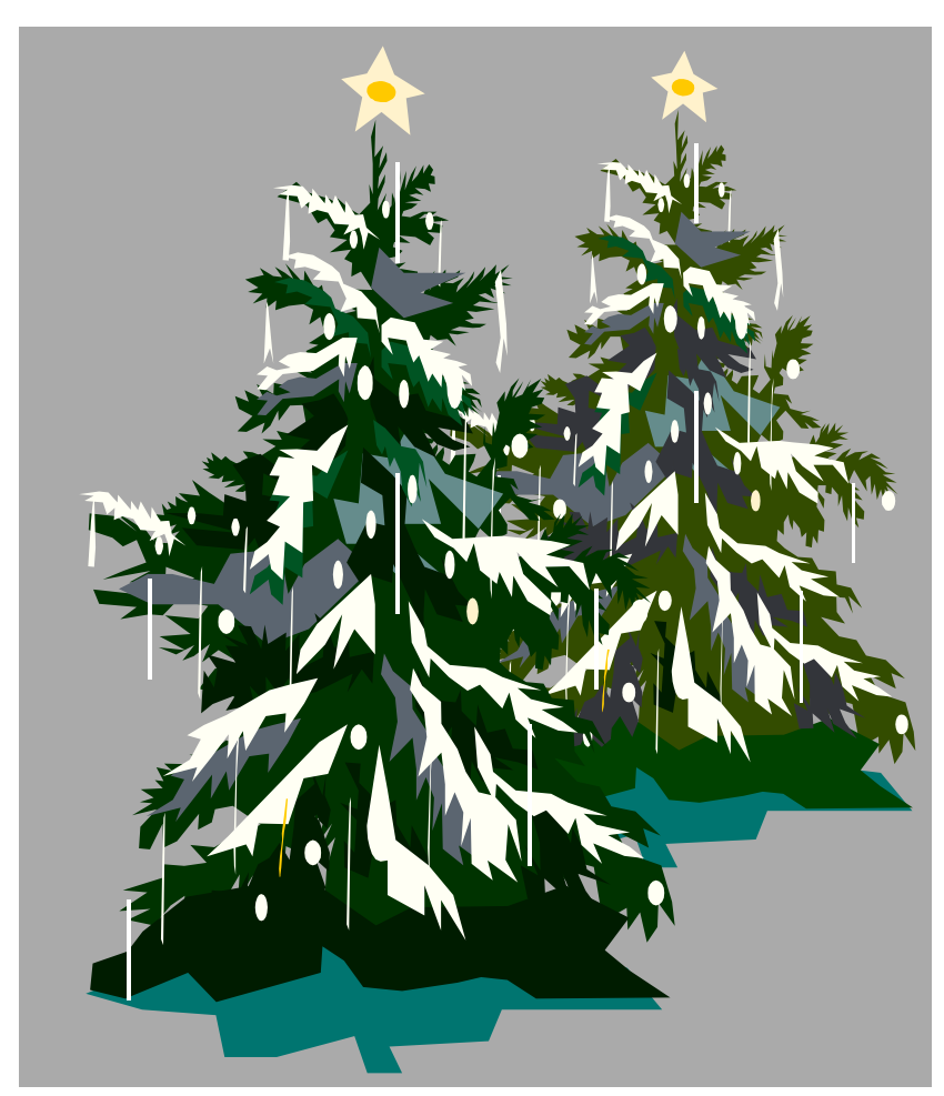
Let it snow, Let it snow, Let it snow!

From our house to yours: As we remember the real reason for this season of celebration, I wish all of you a very Merry Christmas. I hope you have a warm and safe Christmas and abundant blessings in the New Year.