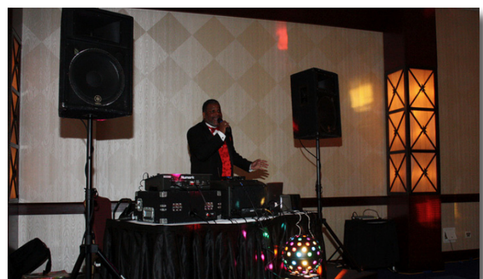
We had a singing DJ!