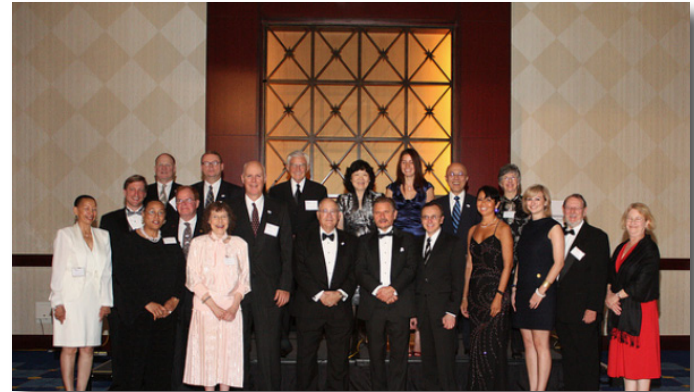
And showed our appreciation to our loyal membership.