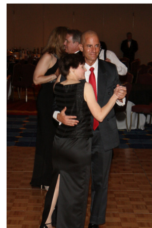
"...Won't you join us and make memories of your own?"

Saturday, June 9 at the J.W. Marriott. Won't you join us and make memories of your own?