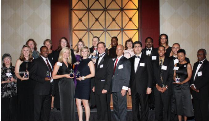
We recognized our Board for their hard work during 2011