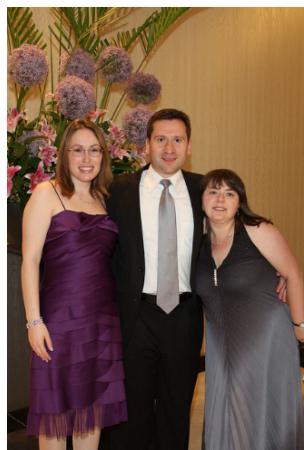
We had fun with our friends!