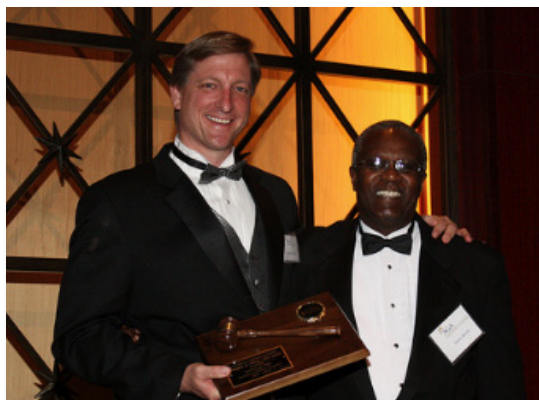
And we had the best looking presidents around!