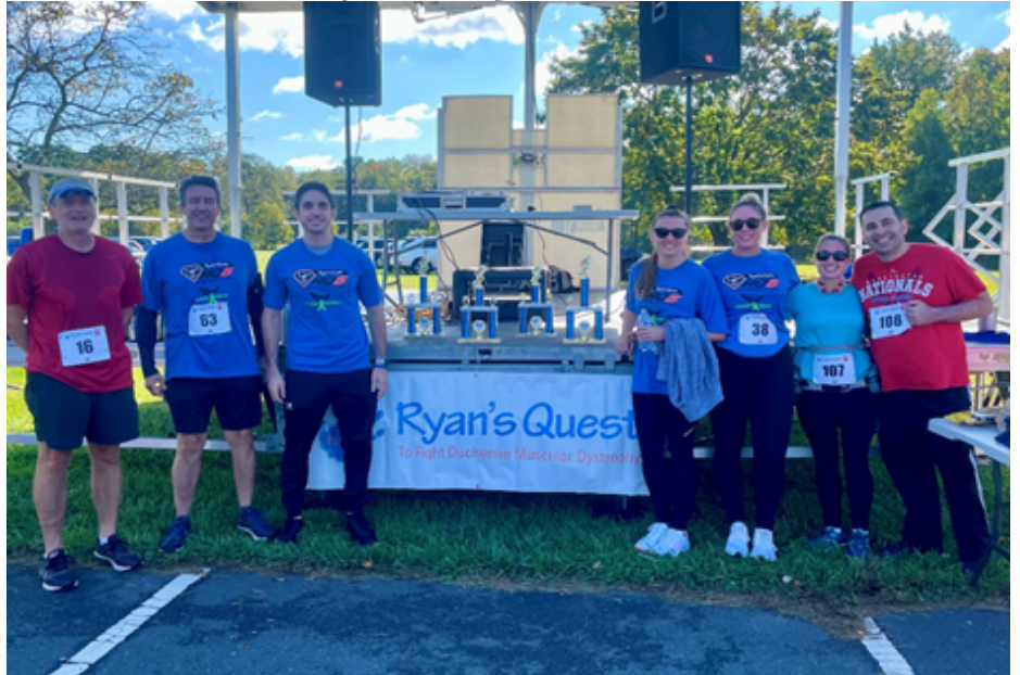
AGA Trenton Chapter members are all smiles at Ryan's Quest 5K!