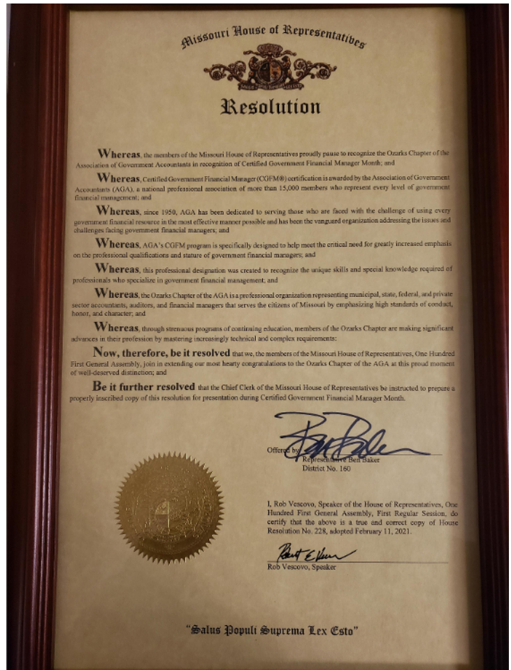
Missouri House of Representatives