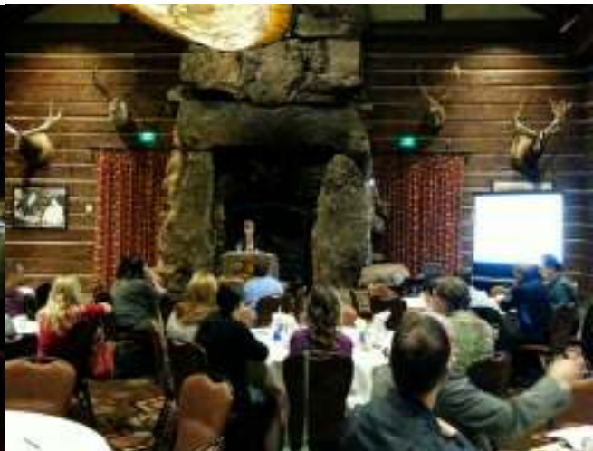
A group works together on the collective bargaining activity.