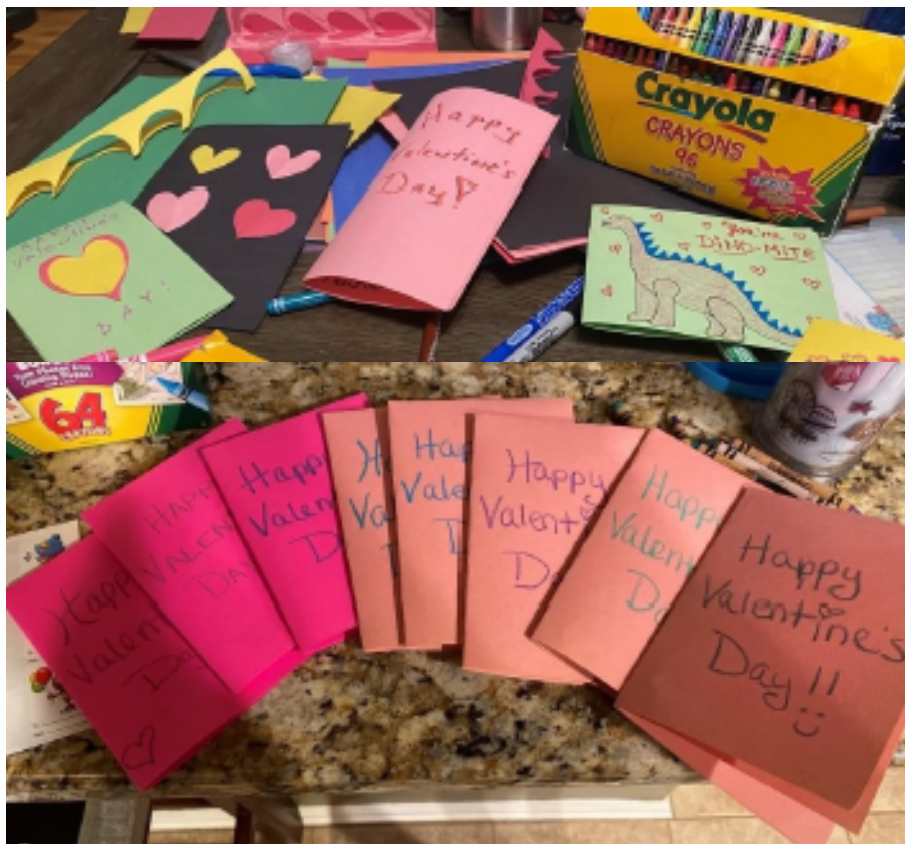
AGA Trenton Chapter's 2021 Valentine's Day Cards

In hopes of bringing some smiles to the residents of a local nursing home, we're again this year asking you to send your handmade or purchased Valentine cards to the following address: