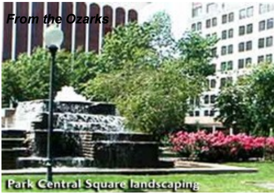
Park Central Square landscaping