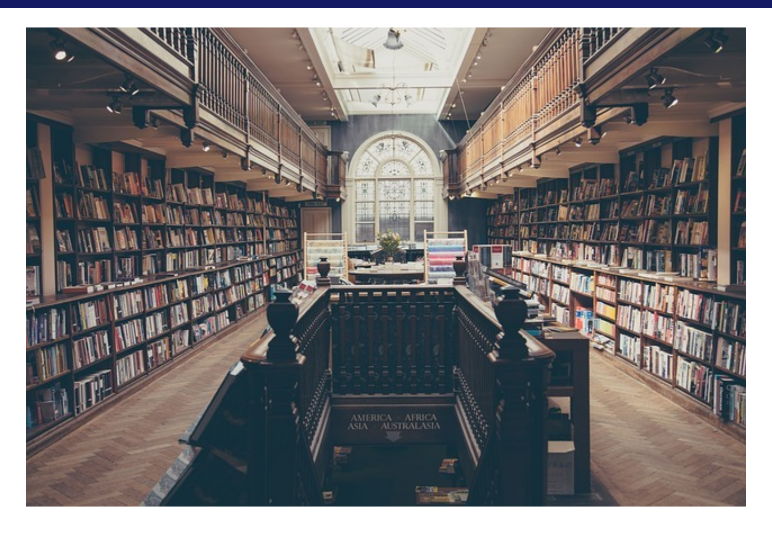
AGA wants to partner with you. Start studying this winter!