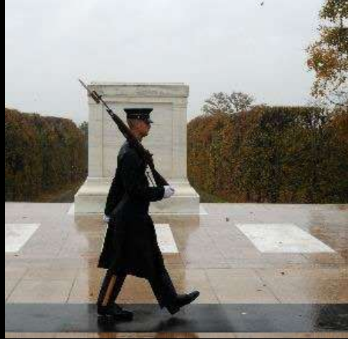
Top left: A sentinel participates in changing of the guard. Right: Members of the Honor Guard practice their moves. Bottom left: U.S. Soldiers perform during Twilight Tattoo. Middle: Sentinel performs duty as Hurricane Sandy arrives.