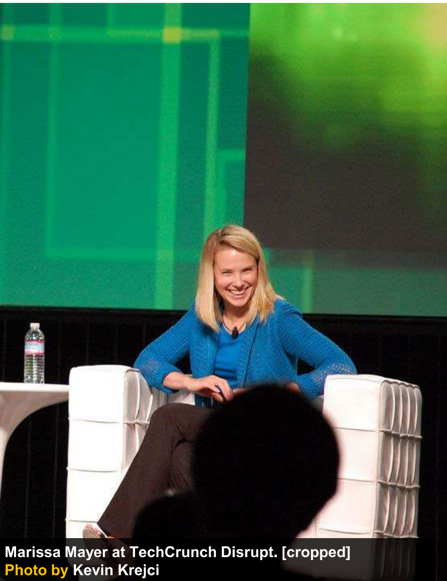
Marissa Mayer at TechCrunch Disrupt. [cropped]