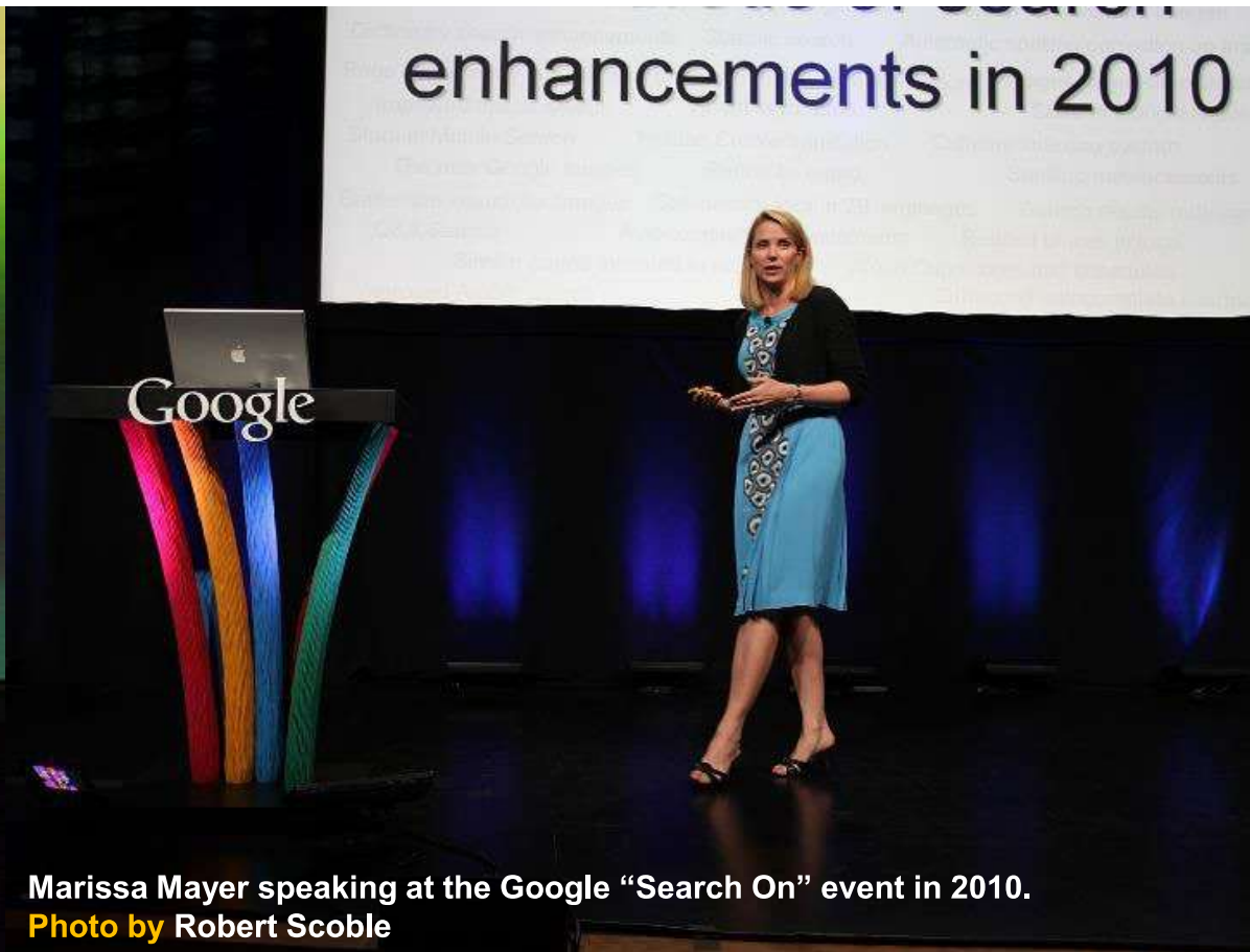
Marissa Mayer speaking at the Google "Search On" event in 2010.