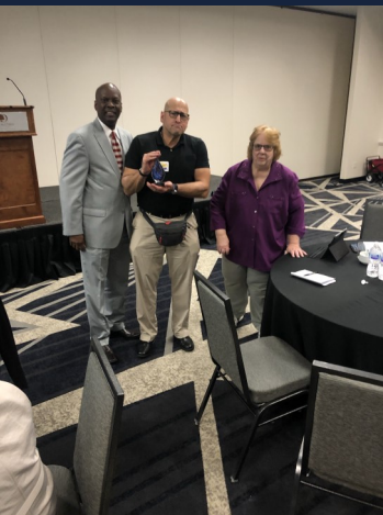
Chapter Awards and More