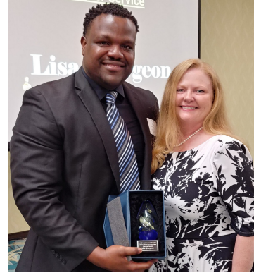
Lisa Spurgeon Service Award