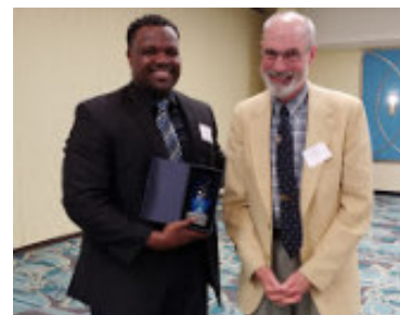
Frances Guidarelli Dedication Award