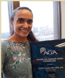
Regional Vice President Award Platinum

We offer affordable lunch hour, half day and full day seminars which are held monthly September-May at various locations with a total of 46 possible CPE's in each program year.