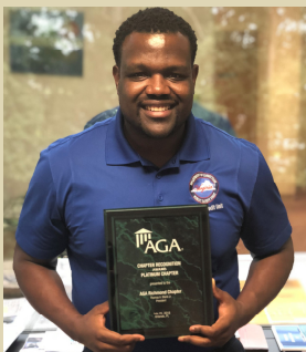
Richmond Chapter National Platinum Award