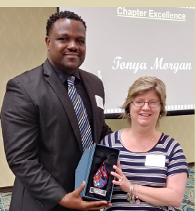
Chapter Excellence Award